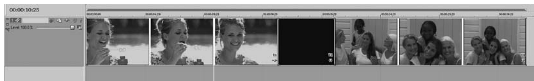
Figure 40-1 A flash frame, in this case a single frame of black that inadvertently snuck in when two clips were not joined properly, will be subconsciously noticeable to the viewer. Be sure to catch and remove these.

A flash frame in a finished project is the number one “fingernails on a chalkboard” peeve of mine. When they are meant for effect, flash frames are a great editing technique. But when it’s just sloppy editing it presents a poor production. After working hours, days, maybe even months on a project, step back and watch it, really watch every frame that passes by. Watch for continuity. Watch for match editing, and above all, watch for those dangling flash frames. You don’t want to discover the mistake as it goes live on the air, debuts at the major stockholders meeting or shows at your grandma’s lifetime achievement party.