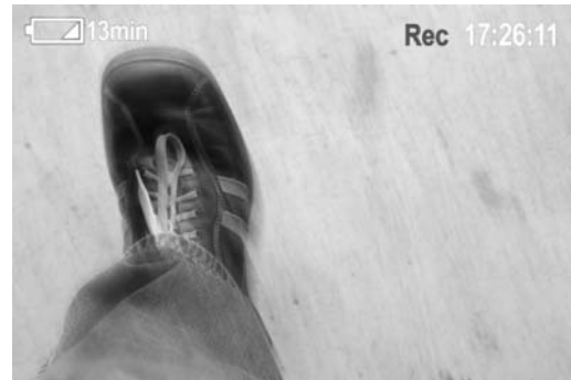
Figure 40-4 Video "footage"—shots of your feet when you thought the camcorder was off—are a common mistake of the beginning videographer.

Even worse is what I call the Waving Camera Syndrome. This looks like an indecisive "which way did he go, Joe, which way did he go," shot. I've seen news photographers do this, too. The shooter follows the action, then sees something else in his peripheral vision and swishes over to that, only to decide that the first shot was better after all, then swishes back. Unless he's shooting a one-camera baseball game where the action happens all at once all over the field, he just ruined both shots. Professional videographers know when it's proper to swish quickly from shot to shot. They always begin each shot from a steady still position, then swish to follow the action, ending the shot at a still position. It gives the eye the chance to settle down before the next clip. Learn to make a decision, follow through with the shot, then quickly frame up, compose and focus for the next shot.