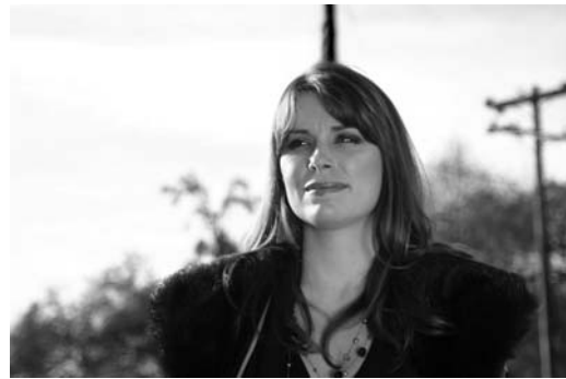
Figure 40-2 When composing your shots, always remember to pay attention to what's happening in the background, so you don't end up with a telephone pole growing out of someone's head.

We're always talking about the "Rule of Thirds" which good Videomaker readers all know: by moving your subject from dead-on center, you will create a more